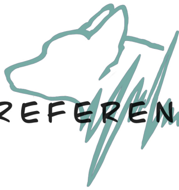
PHOTO REFERENCE GUIDE